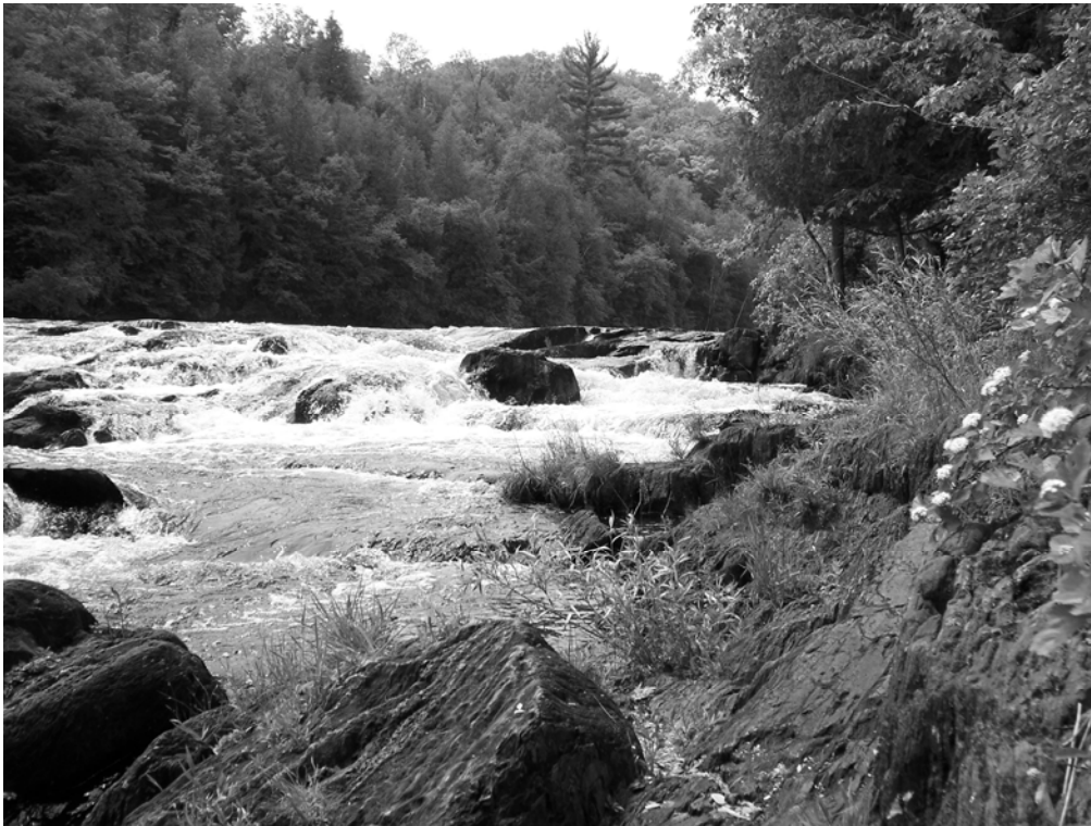
Pier's Gorge, Menominee River, Norway, MI

Serving the Community in Environmental Health, Personal Health Services and Chronic Disease Prevention